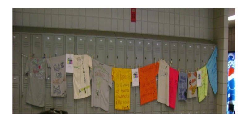
Displayed at Sampson Community College