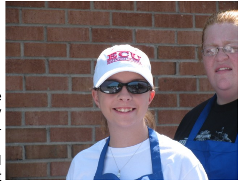
In Honor Of Their “Baby Girl”

The bike ride began at 11am. For those who did not ride, Bar-B-Que plates were available. The event also included a live band, airbrush booth, door prizes, wrestling, raffles, and other entertainment for adults and children. The “Cruising Against Domestic Violence” Bike Ride was an