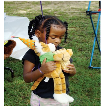
A little girl is playing with the stuffed animal she received from the U Care's Resource Table.

the many agencies represented at the event. Children visiting our tables had a choice of a stuffed animal compliments of the Bee Hive Thrift Stores or a coloring book and crayons. Parents were given literature about U Care's services and the child advocacy program for children of domestic violence. The children appreciated the gifts and seemed to have fun with