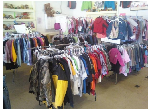
New Fall Line Now Available